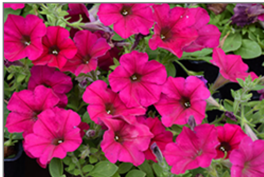
Wave Carmine Velour Petunia flowers

Wave Carmine Velour Petunia is recommended for the following landscape applications;