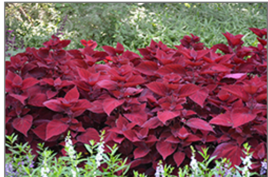
Beale Street Coleus