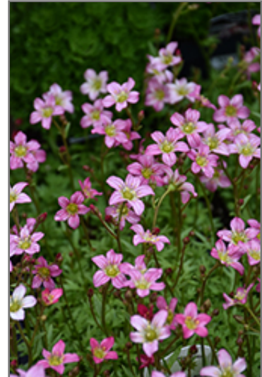
Touran Pink Saxifrage flowers