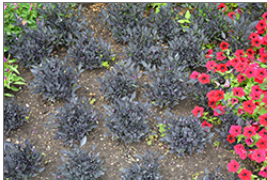
Onyx Red Ornamental Pepper

Onyx Red Ornamental Pepper is a fine choice for the garden, but it is also a good selection for planting in outdoor containers and hanging baskets. It is often used as a 'filler' in the 'spiller-thriller-filler' container combination, providing a mass of flowers against which the larger thriller plants stand out. Note that when growing plants in outdoor containers and baskets, they may require more frequent waterings than they would in the yard or garden.