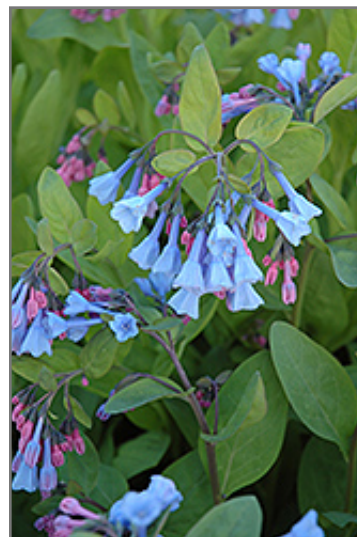
Virginia Bluebells flowers

Virginia Bluebells will grow to be about 18 inches tall at maturity, with a spread of 18 inches. Its foliage tends to remain dense right to the ground, not requiring facer plants in front. It grows at a medium rate, and under ideal conditions can be expected to live for approximately 5 years. As an herbaceous perennial, this plant will usually die back to the crown each winter, and will regrow from the base each spring. Be careful not to disturb the crown in late winter when it may not be readily seen! As this plant tends to go dormant in summer, it is best interplanted with late-season bloomers to hide the dying foliage.