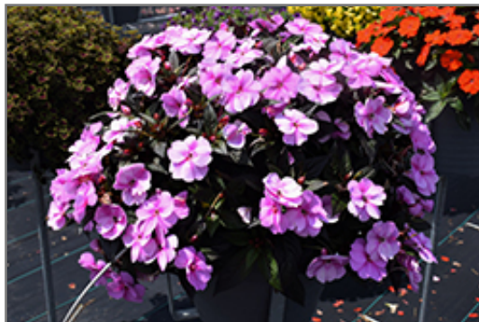
SunPatiens Vigorous Lavender Splash New Guinea Impatiens in bloom

SunPatiens Vigorous Lavender Splash New Guinea Impatiens is a fine choice for the garden, but it is also a good selection for planting in outdoor containers and hanging baskets. Because of its height, it is often used as a 'thriller' in the 'spiller-thriller-filler' container combination; plant it near the center of the pot, surrounded by smaller plants and those that spill over the edges. It is even sizeable enough that it can be grown alone in a suitable container. Note that when growing plants in outdoor containers and baskets, they may require more frequent waterings than they would in the yard or garden.