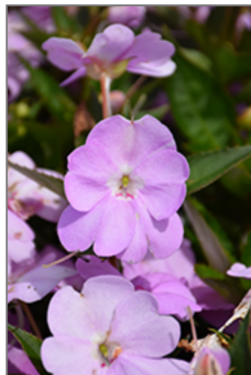
SunPatiens Vigorous Orchid Impatiens flowers

SunPatiens Vigorous Orchid Impatiens is recommended for the following landscape applications;