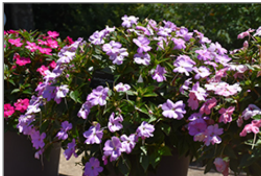
SunPatiens Vigorous Orchid Impatiens in bloom

SunPatiens Vigorous Orchid Impatiens is a fine choice for the garden, but it is also a good selection for planting in outdoor containers and hanging baskets. Because of its height, it is often used as a 'thriller' in the 'spiller-thriller-filler' container combination; plant it near the center of the pot, surrounded by smaller plants and those that spill over the edges. It is even sizeable enough that it can be grown alone in a suitable container. Note that when growing plants in outdoor containers and baskets, they may require more frequent waterings than they would in the yard or garden.