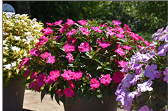
SunPatiens Vigorous Rose Pink New Guinea Impatiens in bloom

SunPatiens Vigorous Rose Pink New Guinea Impatiens is a fine choice for the garden, but it is also a good selection for planting in outdoor containers and hanging baskets. Because of its height, it is often used as a 'thriller' in the 'spiller-thriller-filler' container combination; plant it near the center of the pot, surrounded by smaller plants and those that spill over the edges. It is even sizeable enough that it can be grown alone in a suitable container. Note that when growing plants in outdoor containers and baskets, they may require more frequent waterings than they would in the yard or garden.