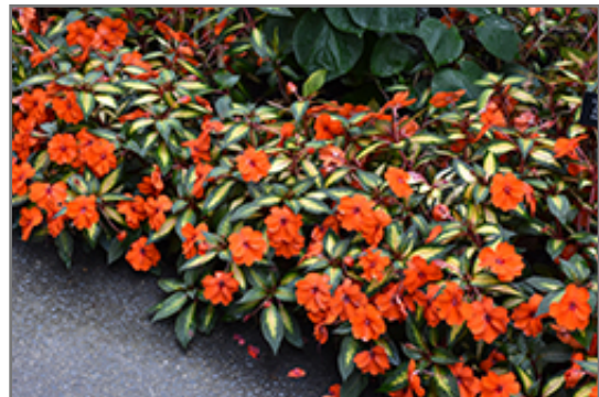
SunPatiens Vigorous Tropical Orange New Guinea Impatiens in bloom