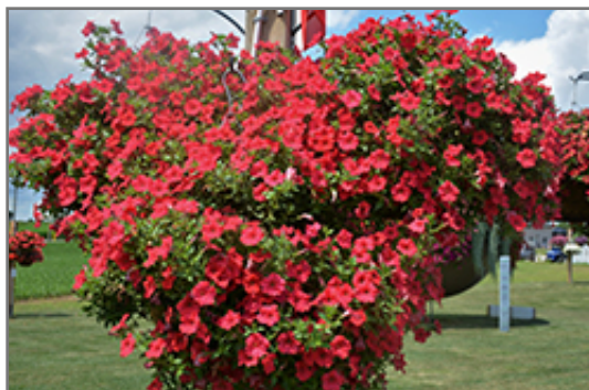
ColorRush Watermelon Red Petunia in bloom

ColorRush Watermelon Red Petunia is a fine choice for the garden, but it is also a good selection for planting in outdoor containers and hanging baskets. It is often used as a 'filler' in the 'spiller-thriller-filler' container combination, providing a mass of flowers against which the thriller plants stand out. Note that when growing plants in outdoor containers and baskets, they may require more frequent waterings than they would in the yard or garden.