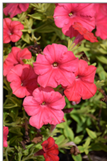
ColorRush Watermelon Red Petunia flowers