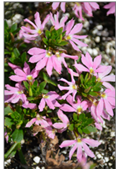
Surdiva Classic Pink Fan Flower flowers