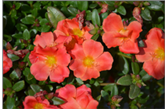
Pazzaz Orange Flare Portulaca flowers

Pazzaz Orange Flare Portulaca is recommended for the following landscape applications;