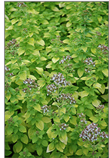
Golden Oregano flowers