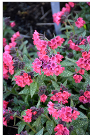
Shrimps On The Barbie Lungwort flowers

Shrimps On The Barbie Lungwort is recommended for the following landscape applications;