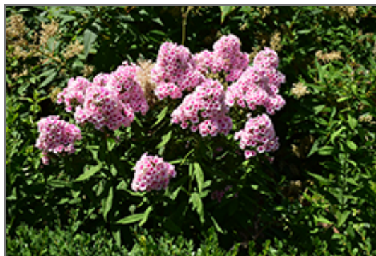
Bright Eyes Garden Phlox in bloom