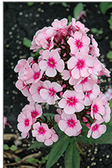
Bright Eyes Garden Phlox flowers

* This is a 'special order' plant - contact store for details