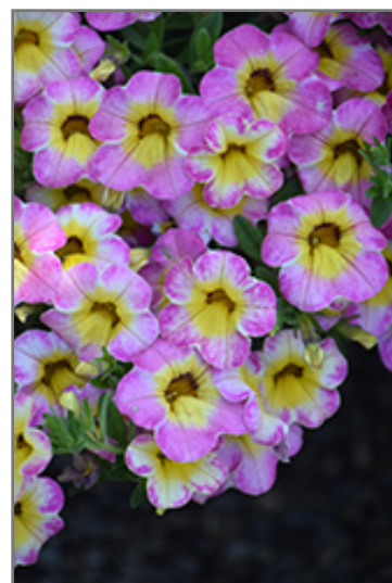
Cha-Cha Diva Hot Pink Calibrachoa flowers