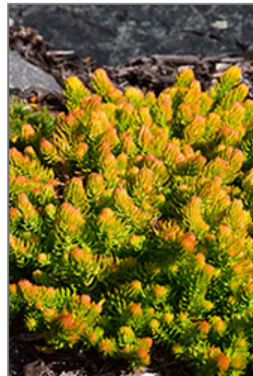
Angelina Stonecrop foliage