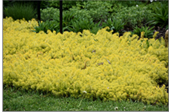
Angelina Stonecrop

This plant does best in full sun to partial shade. It prefers dry to average moisture levels with very well-drained soil, and will often die in standing water. It is considered to be drought-tolerant, and thus makes an ideal choice for a low-water garden or xeriscape application. It is not particular as to soil pH, but grows best in poor soils, and is able to handle environmental salt. It is highly tolerant of urban pollution and will even thrive in inner city environments. This is a selected variety of a species not originally from North America. It can be propagated by division; however, as a cultivated variety, be aware that it may be subject to certain restrictions or prohibitions on propagation.