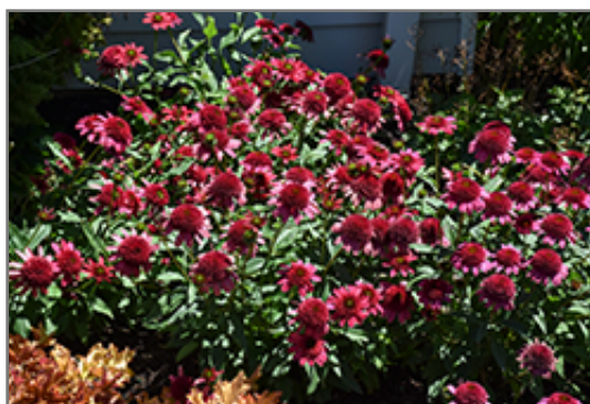
Sunny Days Ruby Coneflower in bloom