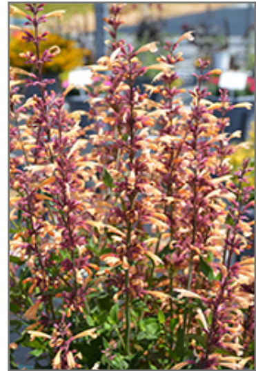
Meant To Bee Queen Nectarine Anise Hyssop flowers

Meant To Bee Queen Nectarine Anise Hyssop is recommended for the following landscape applications;