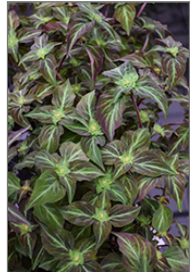
Night Light Moneywort foliage

Night Light Moneywort is recommended for the following landscape applications;