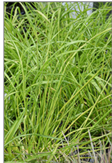
Prairie Winds Lemon Squeeze Fountain Grass foliage