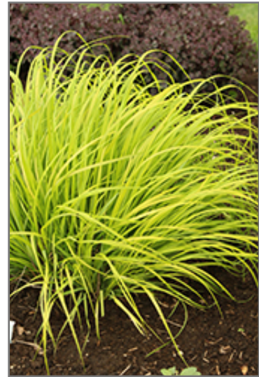
Prairie Winds Lemon Squeeze Fountain Grass

Prairie Winds Lemon Squeeze Fountain Grass is recommended for the following landscape applications;