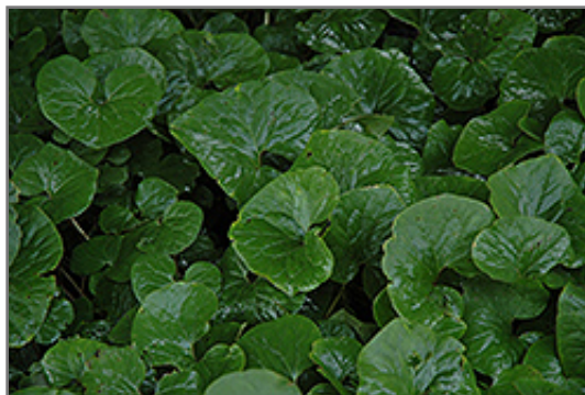
Canadian Wild Ginger