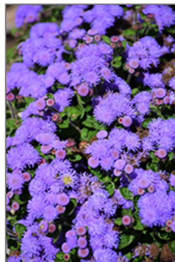
Bumble Blue Flossflower flowers