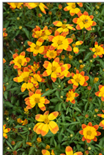
Bidy Boom Red Bidens flowers