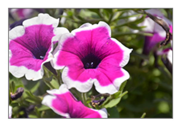
Main Stage Violet Picotee Petunia flowers

Main Stage Violet Picotee Petunia is a dense herbaceous annual with a trailing habit of growth, eventually spilling over the edges of hanging baskets and containers. Its medium texture blends into the garden, but can always be balanced by a couple of finer or coarser plants for an effective composition.