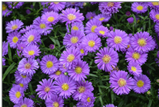
Magic Purple Aster flowers

Magic Purple Aster is recommended for the following landscape applications;