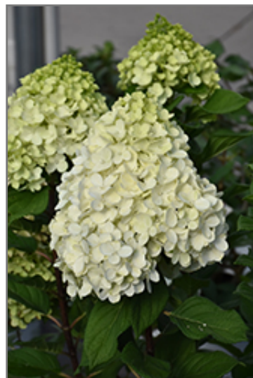
Little Lime Punch Hydrangea flowers