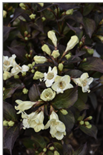
Wine & Spirits Weigela flowers