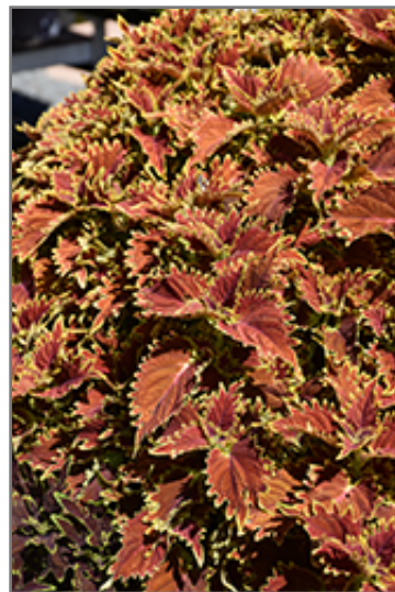
Copperhead Coleus foliage