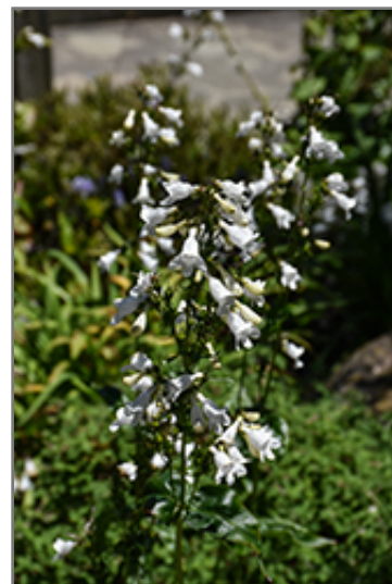
Foxglove Beardtongue flowers