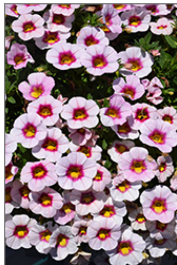
Eyeconic Cherry Blossom Calibrachoa flowers

Eyeconic Cherry Blossom Calibrachoa is recommended for the following landscape applications;