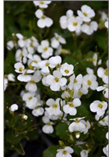
Catwalk White Wall Cress flowers