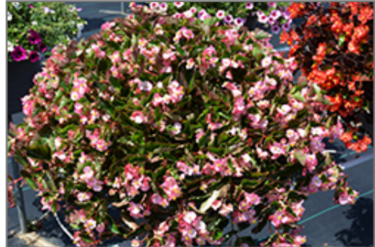
Hula Pink Begonia in bloom

Hula Pink Begonia is a fine choice for the garden, but it is also a good selection for planting in outdoor containers and hanging baskets. Because of its spreading habit of growth, it is ideally suited for use as a 'spiller' in the 'spiller-thriller-filler' container combination; plant it near the edges where it can spill gracefully over the pot. Note that when growing plants in outdoor containers and baskets, they may require more frequent waterings than they would in the yard or garden.