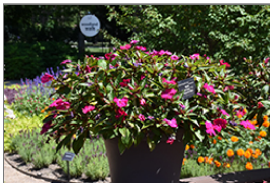
Solarscape Magenta Bliss Impatiens in bloom

Solarscape Magenta Bliss Impatiens will grow to be about 9 inches tall at maturity, with a spread of 20 inches. When grown in masses or used as a bedding plant, individual plants should be spaced approximately 14 inches apart. Its foliage tends to remain low and dense right to the ground. This fast-growing annual will normally live for one full growing season, needing replacement the following year.