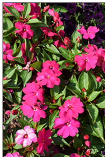
Solarscape Magenta Bliss Impatiens flowers

Solarscape Magenta Bliss Impatiens is recommended for the following landscape applications;