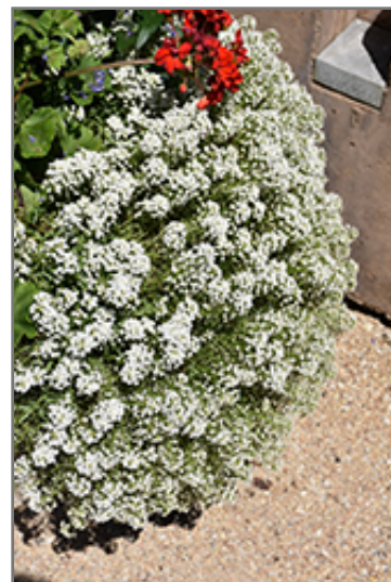
Easy Breezy White Lobularia flowers