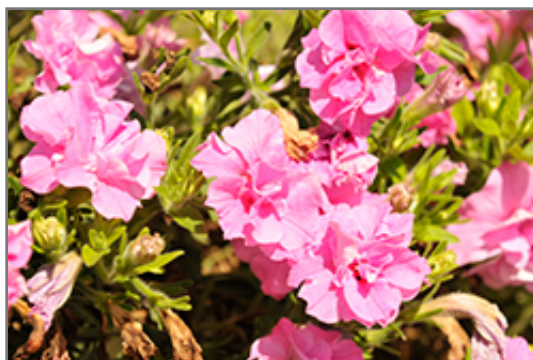
Vogue Pink Double Petunia flowers