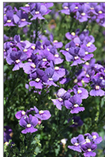
Nesia Denim Nemesia flowers