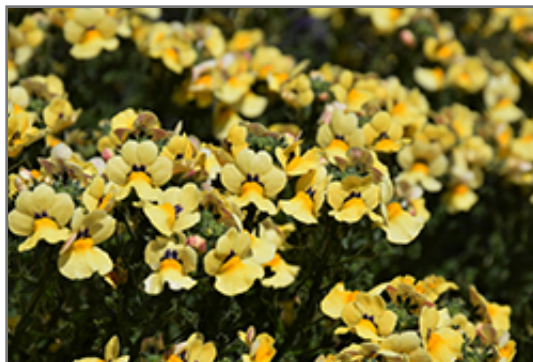
Nesia Inca Nemesia flowers