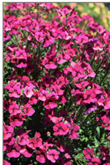
Nesia Magenta Nemesia flowers