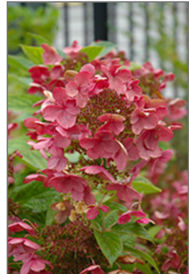
Quick Fire Hydrangea flowers (faded)

This shrub performs well in both full sun and full shade. It prefers to grow in average to moist conditions, and shouldn't be allowed to dry out. It is not particular as to soil type or pH. It is highly tolerant of urban pollution and will even thrive in inner city environments. Consider applying a thick mulch around the root zone in winter to protect it in exposed locations or colder microclimates. This is a selected variety of a species not originally from North America.