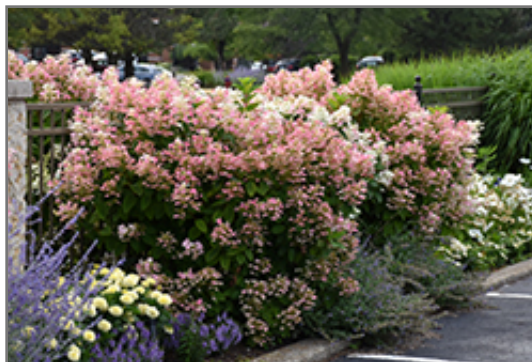
Quick Fire Hydrangea in bloom