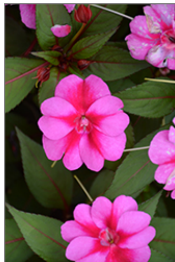
SunPatiens Compact Purple Candy Impatiens flowers

SunPatiens Compact Purple Candy Impatiens is recommended for the following landscape applications;