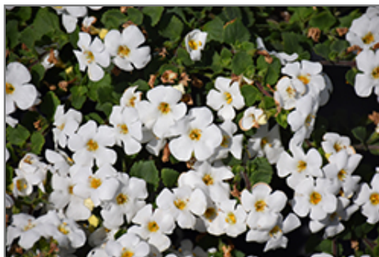
MegaCopa White Bacopa flowers