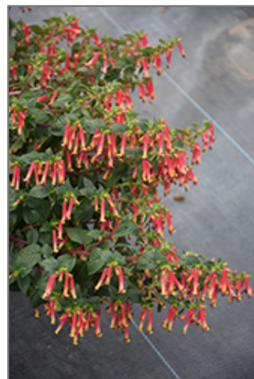
Hummingbird's Lunch Cuphea in bloom