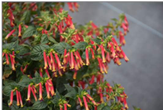
Hummingbird's Lunch Cuphea flowers