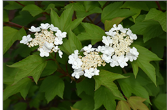
Redwing Highbush Cranberry flowers

Redwing Highbush Cranberry is a dense multi-stemmed deciduous shrub with an upright spreading habit of growth. Its average texture blends into the landscape, but can be balanced by one or two finer or coarser trees or shrubs for an effective composition.