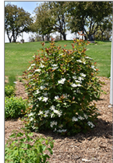
Redwing Highbush Cranberry in bloom