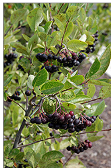
Iroquois Beauty Black Chokeberry fruit