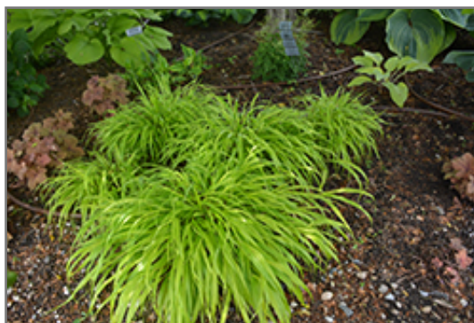
All Gold Hakone Grass