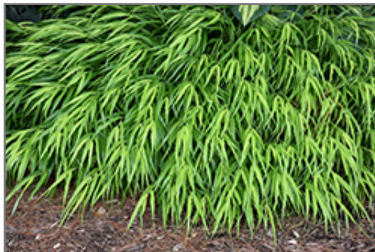
All Gold Hakone Grass foliage