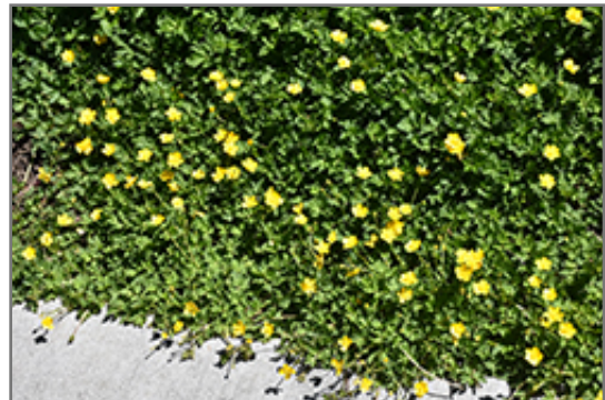
Barren Strawberry in bloom