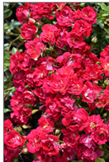
Red Drift Rose flowers

Red Drift Rose is recommended for the following landscape applications;