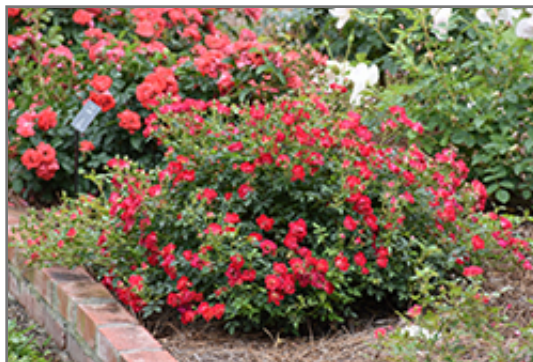
Red Drift Rose in bloom