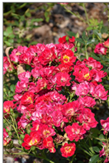
Pink Drift Rose flowers

Pink Drift Rose is recommended for the following landscape applications;