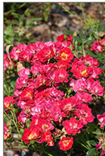
Pink Drift Rose flowers

Pink Drift Rose is recommended for the following landscape applications;