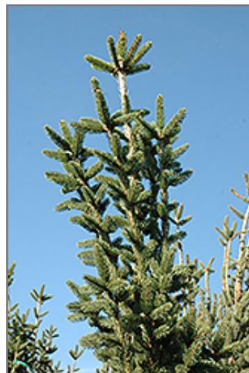
Columnar Norway Spruce foliage